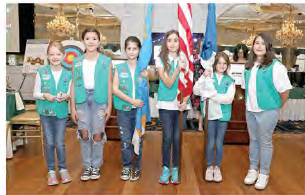
Troop 1066 hosted the Flag Ceremony