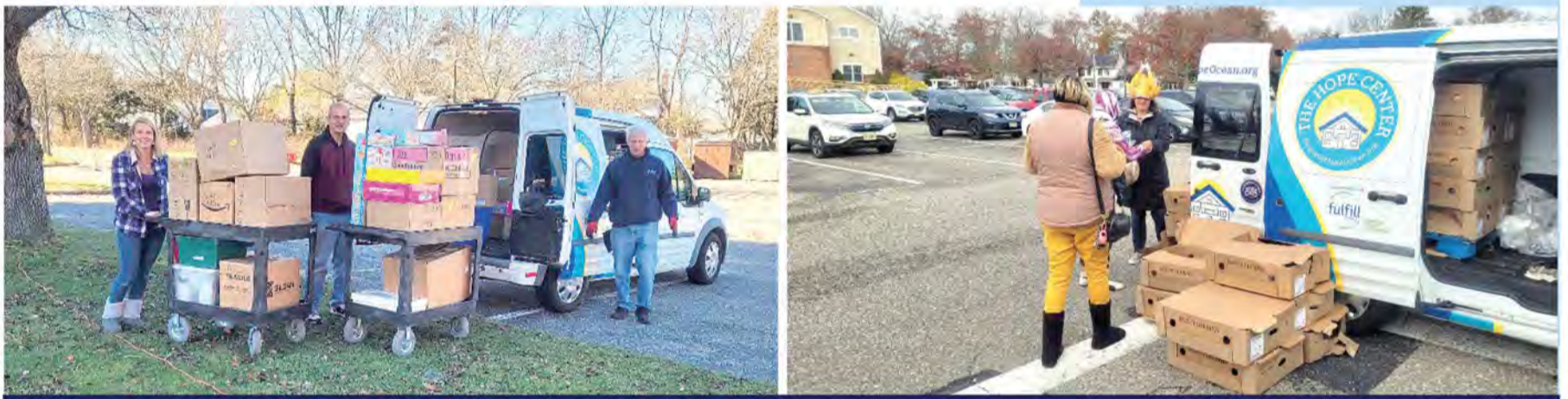
The HOPE Center van has been busy distributing food and supplies to the Ocean County community.

Within a place of hope and faith, The HOPE Center's mission is to serve individuals and families in crisis with dignity and compassion, providing for their basic human needs and striving to empower each person to achieve his or her greatest level of self-sufficiency.