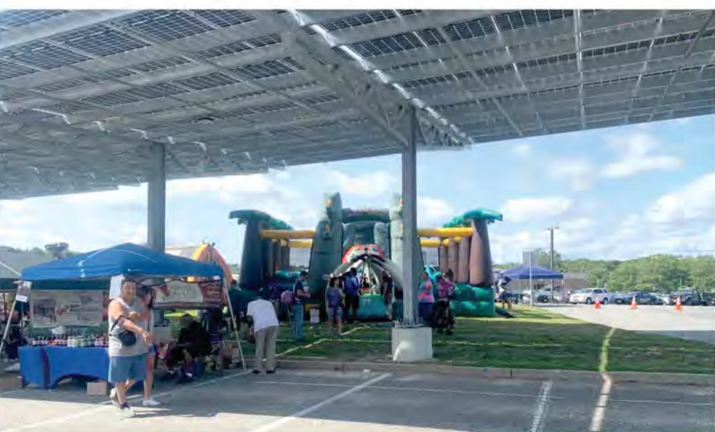
The solar carports, seen here on Pirate's Day at Russell O. Brackman Middle School, provide shelter alongside their environmental benefits.