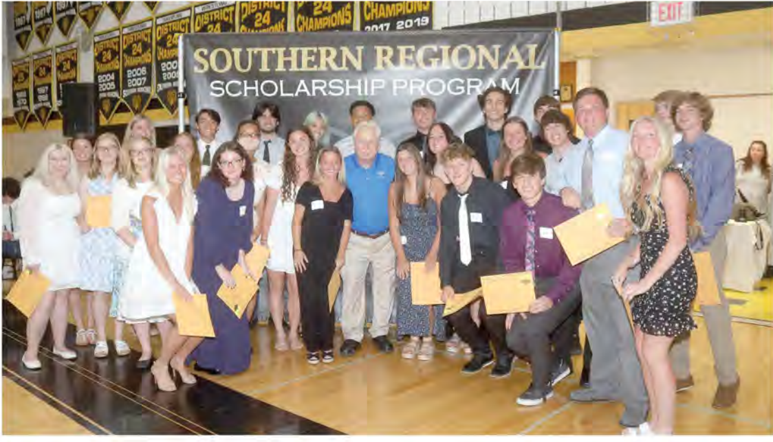
The 2022 Scholarship recipients from Southern Regional High School.

The program started with five scholarships each year and has since grown to 25-30 scholarship awards to graduating students from Southern Regional High School, Barnegat High School, and Pinelands High School. The program provides financial assistance to students of Causeway employees, Causeway customers and those in need of financial assistance to help them pursue their academic dreams and achieve their goals.